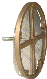
FLAME SCREEN AND SPACER